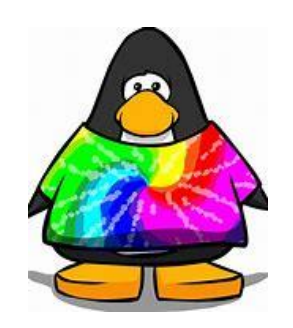
August 1 - 3

<u>Note: All activities, events and bands are subject to change or cancellation at any time</u>