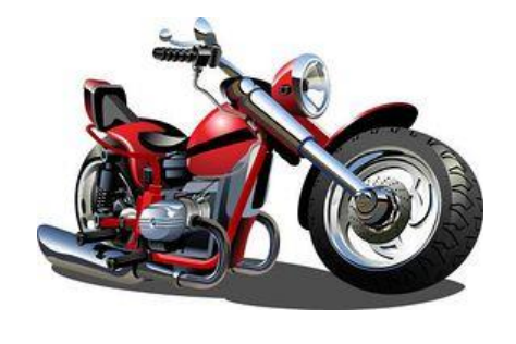
May 27 - 31 Americade Motorcycle Rally in Lake George Village

<u>Sunday June 15</u> – Happy Father's Day Dads collect one free candy bar at the store (Free!)