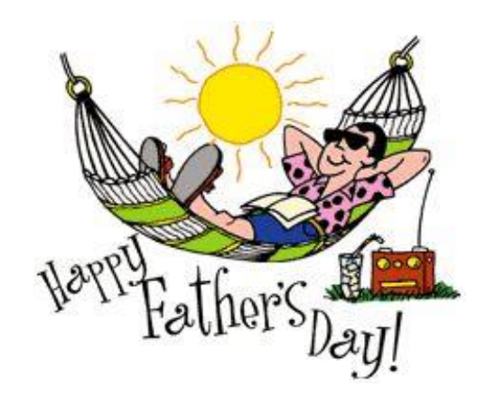
June 13 - 15 Father's Day Weekend – celebrate dad